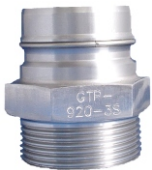
Male GTP-920-3S BSP Stainless Steel