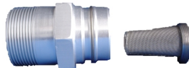
GTP-1534 Optional Strainer for all 1 1/2" actuators, except GTP-920-3S 24 x 110 mesh stainless steel. If you want the strainer and actuator assembly, order GTP-1510