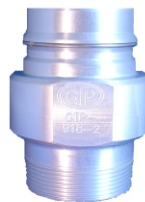
GTP-918-2 2" NPT GTP-918-4 2" BSP