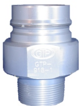
GTP-918-1 1 1/2" NPT GTP-918-3 1 1/2" BSP