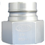
Female GTP-920-1 NPT GTP-920-4 BSP