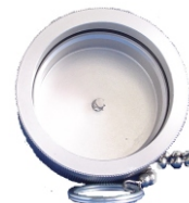
GTP-1653 Dust Cap with Chain