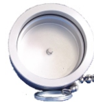
GTP-1428 Dust Cap with Chain